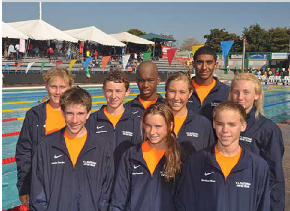
Virgin Islands National Swim Team at XXVIII CARIFTA Swim-